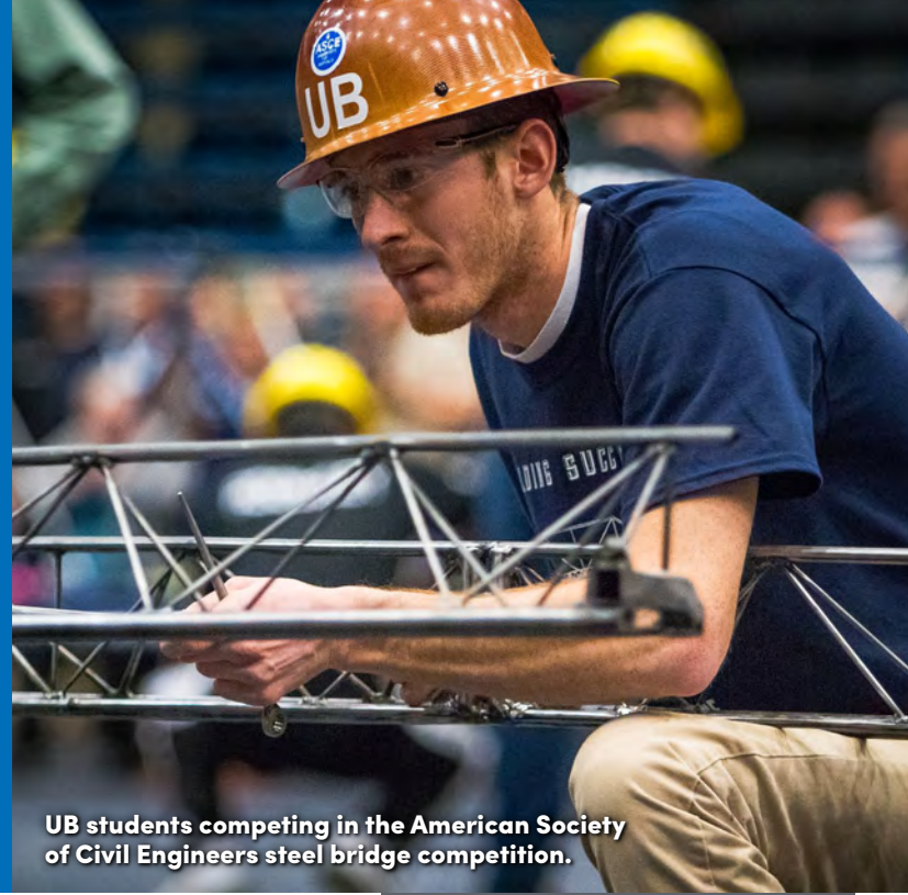
UB students competing in the American Society of Civil Engineers steel bridge competition.

A member of the prestigious Association of American Universities, the University at Buffalo stands in the first rank among the nation's research-intensive public universities. The School of Engineering and Applied Sciences is New York State's largest and most comprehensive public school of engineering.